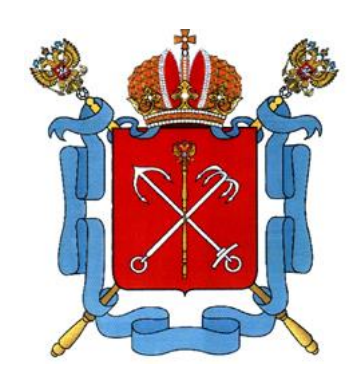
City of Saint Petersburg Administration