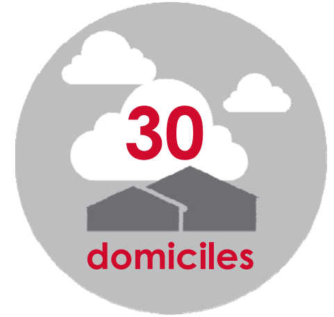
of access to funds