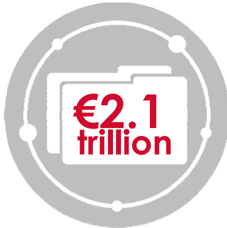
of funds deposited across the Euroclear group