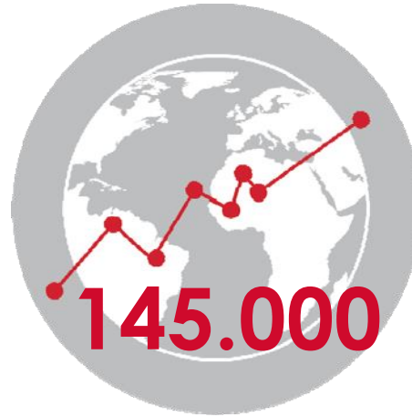
a leading range of investment funds worldwide global coverage