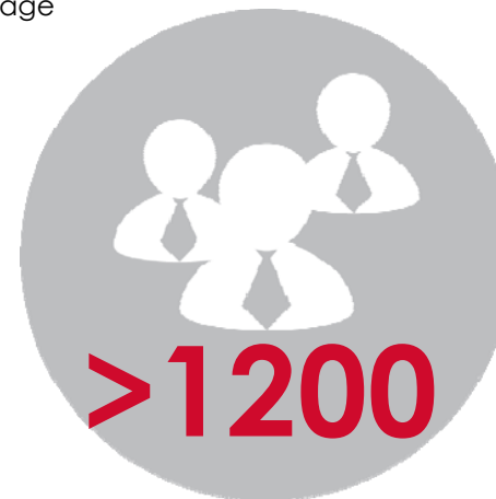
Links with over 1200 fund administrators